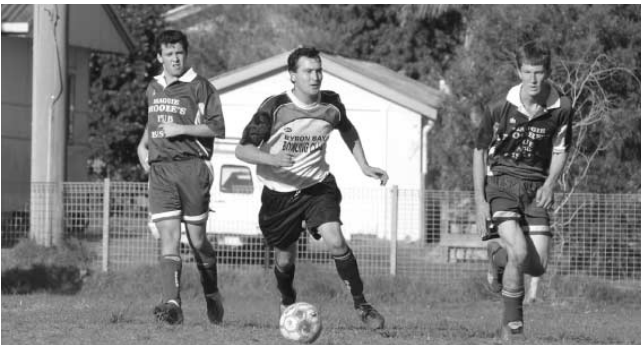
Byron Soccer - unhappy that rec grounds pitch won't be upgraded.

We thought for once that this situation would be rectified but once again it is not to be.