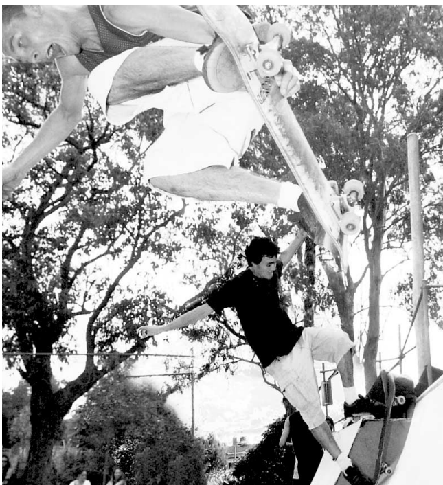
Local skateboarders at the Bruns Skate Park.

There will be a Coaching and Sign on day for FNC Skateboarding on Sunday January 11, 2004 at Missingham Bridge skatepark, Ballina.